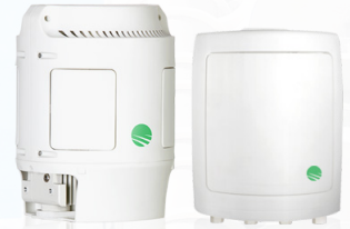
EtherHaul™ Street Level