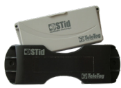
TeleTag® Windscreen tag